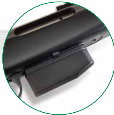
5 Round Magazine