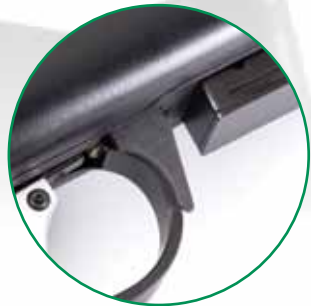
Magazine Release Catch