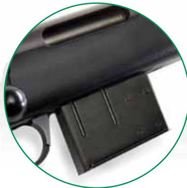
Optional 10 Round Magazine