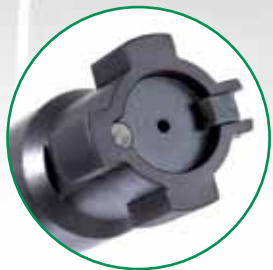
Quadlite® Bolt Face